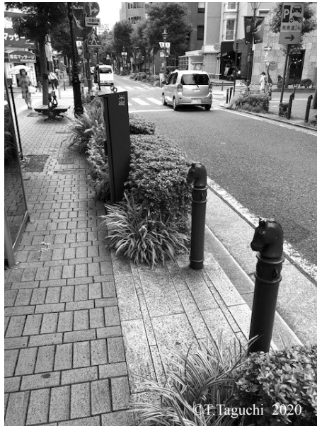
Bashamichi Shopping Avenue

This type of agreement was incorporated in the design of specific proposals which eventually led to the installation of sidewalk trees and street lights as mentioned previously. The first priority was the confirmation of mutual and voluntary consensus, and the physical design was conceived later as means to materialize the agreed ideas. Otherwise, it would have been impossible to implement the proposed demolition of the existing covered arcades at this time when the installation of covered arcades was a trend among many shopping avenues.