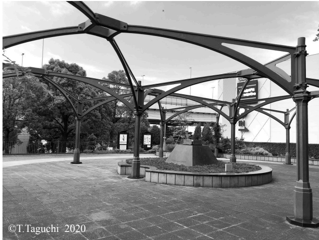
Cast-iron frames of the former Les Halles in Paris

requires the spirit and a method of making the most of the city's detailed history to create the history of the future.