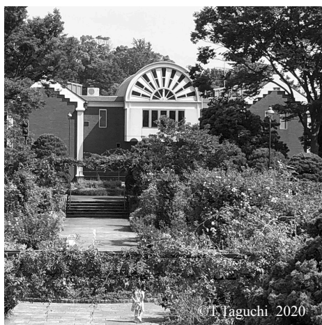
Jiro Osaragi Memorial Museum