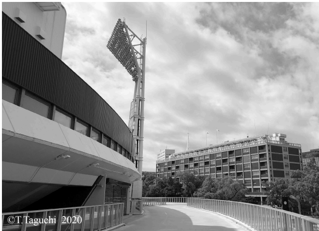
Yokohama Stadium and the City Hall

However, it was not so easy. In terms of the concept of the plan, there was a question of whether it would be appropriate to build a large-scale baseball stadium in Yokohama Park, located in the designated zone in the "Green Axis" plan connecting Nihon Odori, Yokohama Park, and Odori Park. Furthermore, there is a legal problem where the size of the facilities in the park is restricted by the City Park Law which makes it difficult to build a large-scale baseball stadium. Another problem is that the park land was nationally-owned and the city was merely a land administrator borrowing the land, which meant that it was difficult to gain approval for the construction of the facility for a professional team from the central government.