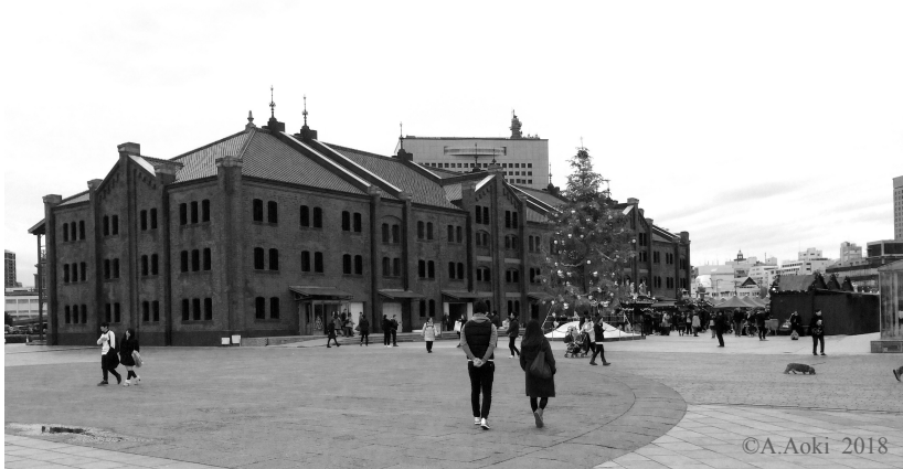
Red Brick Warehouse

While this warehouse is located inside the bonded area at the port and is not visible to the public, the 150-m long structure is reinforced with steel frames using the latest technology. One can say it is one of the symbols of Japan's modern technology, and it is also a symbol of Minato. In addition, it represents a story of Yokohama's westernization period. A considerable number of impressive brick buildings had existed in Yokohama during the Meiji period, including the Yokohama District Court, Yokohama Post and Telegraph Office, Yokohama Customs Office, Sacred Heart Cathedral Yokohama (Yamate Church,) Yokohama City Hall (the second building,) Yokohama Station (the second building) among others. They were all destroyed by the Great Kanto Earthquake, and the Red Brick Warehouse is valuable building that survived to this day and still tells us a little bit of the story of its era.